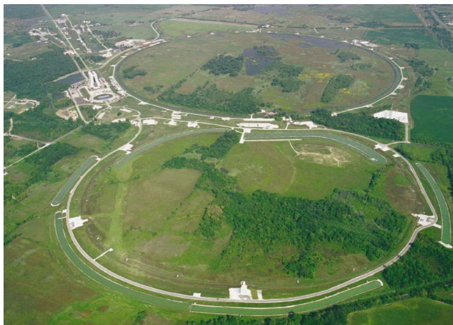
Crash course: the newly refurbished Tevatron will put some variants of brane theory to the test.

As more dimensions are added, the length scale over which these effects would show up becomes smaller. But even with seven additional dimensions — the same number as in the leading variant of string theory — it would only shrink to about the size of an atomic nucleus. That is a far cry from the 10^{-35} m of