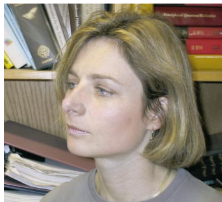
Hidden force: Lisa Randall suggests that gravity may leak into a parallel brane universe.

One entertaining version of brane-world theory offers an unusual explanation for 'dark matter', the Universe's 'missing' mass that can be detected by its gravitational influence, yet