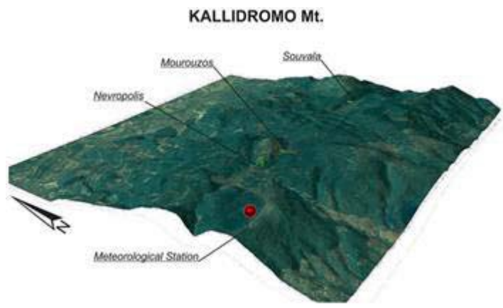
Figure 2. Locations of the studied MTPs of Mt. Kallidromo on a Digital Elevation Model (Alexopoulos et al., 2015).

The current study aims to present a dataset of the geo-environmental parameters in order to assess the potential hazards for these priority habitats. Furthermore, it is also worth mentioning that MTPs are unevenly studied, regarding their geological, hydrological, hydrochemical, geochemical and mineralogical characteristics and this work provides a first report on an integrated evaluation of these parameters regarding the qualitative and quantitative risk identification of the MTPs in Central Greece (Alexopoulos et al., 2015; Delipetrou et al., 2015; Stamatakis et al., 2015; Vasilatos et al., 2015).