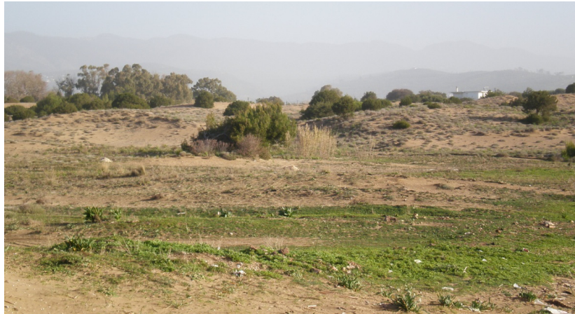
Figure 2 Coastal sand dune ridges.

The four dune lines, comprising the central Kyparissiakos Gulf dune field (Ghionis and Ferentinos, 1992, Karamousalis et al. 2007, Poulos et al. 2012), lie at distances from the coastline of 20-40 m (1 st ), 140-180 m (2 nd ), 450-470 (3 rd ) and up to 650 m (4 th ). Elevations in the dune field vary between 2 and 13 m, with the highest corresponding to the 3 rd dune line.