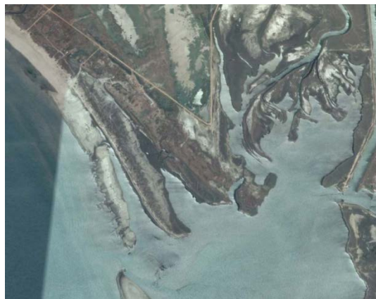
Figure 3. Satellite image of the area "a" of figure 2.