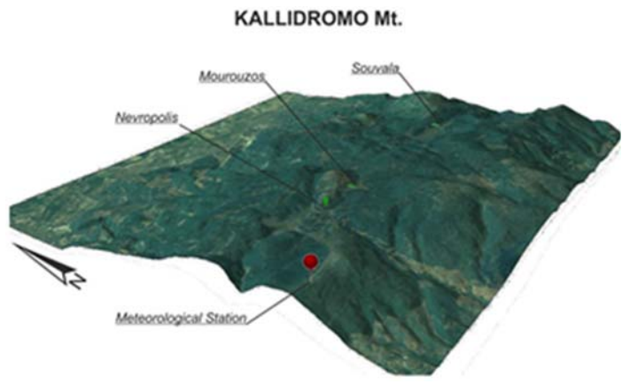
Figure 2. Locations of the studied MTPs of Mt. Kallidromo on a Digital Elevation Model (Alexopoulos et al., 2015).

The current study aims to present a dataset of the geo-environmental parameters in order to assess the potential hazards for these priority habitats. Furthermore, it is also worth mentioning that MTPs are unevenly studied, regarding their geological, hydrological, hydrochemical, geochemical and mineralogical characteristics and this work provides a first report on an integrated evaluation of these parameters regarding the qualitative and quantitative risk identification of the MTPs in Central Greece (Alexopoulos et al., 2015; Delipetrou et al., 2015; Stamatakis et al., 2015; Vasilatos et al., 2015).