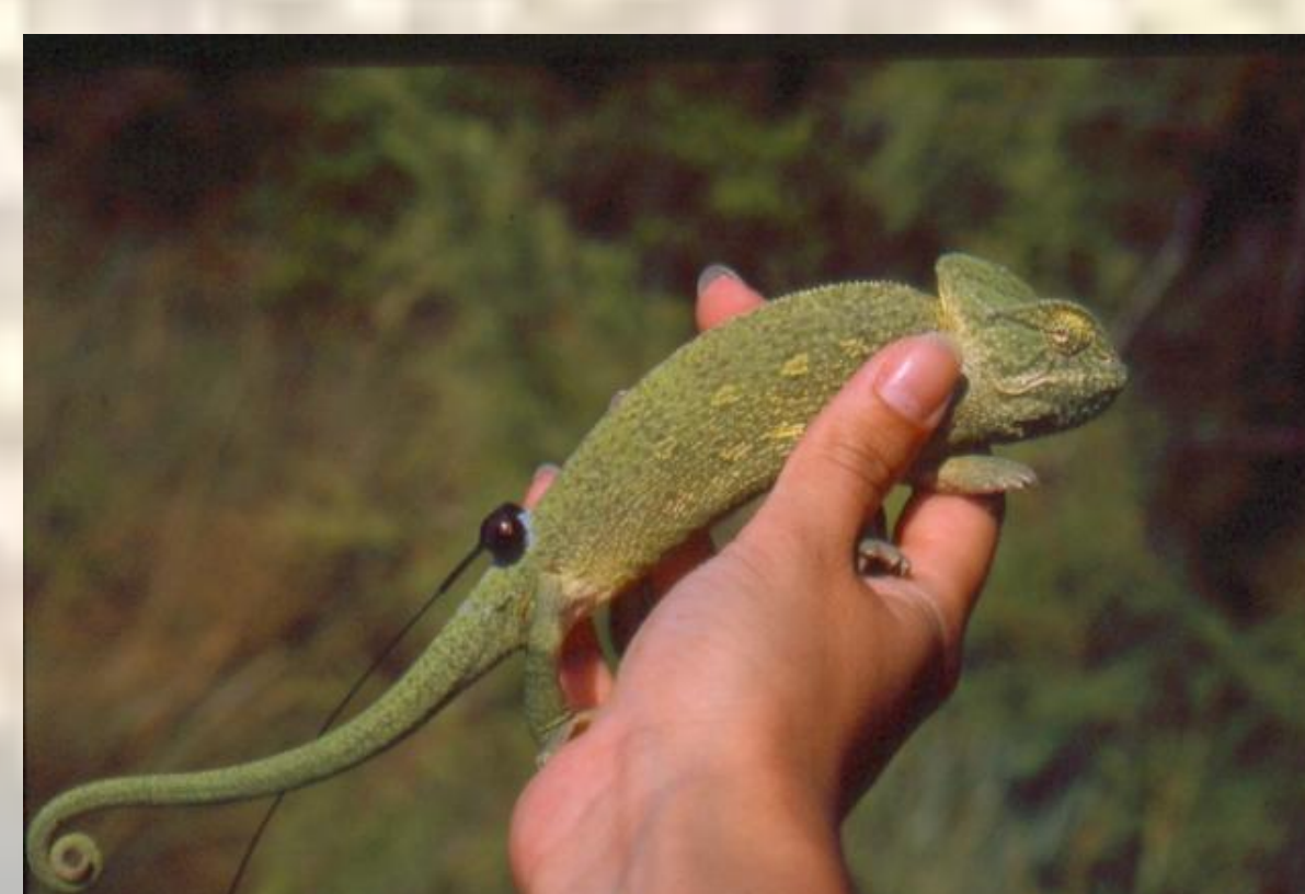
C. africanus from Pylos