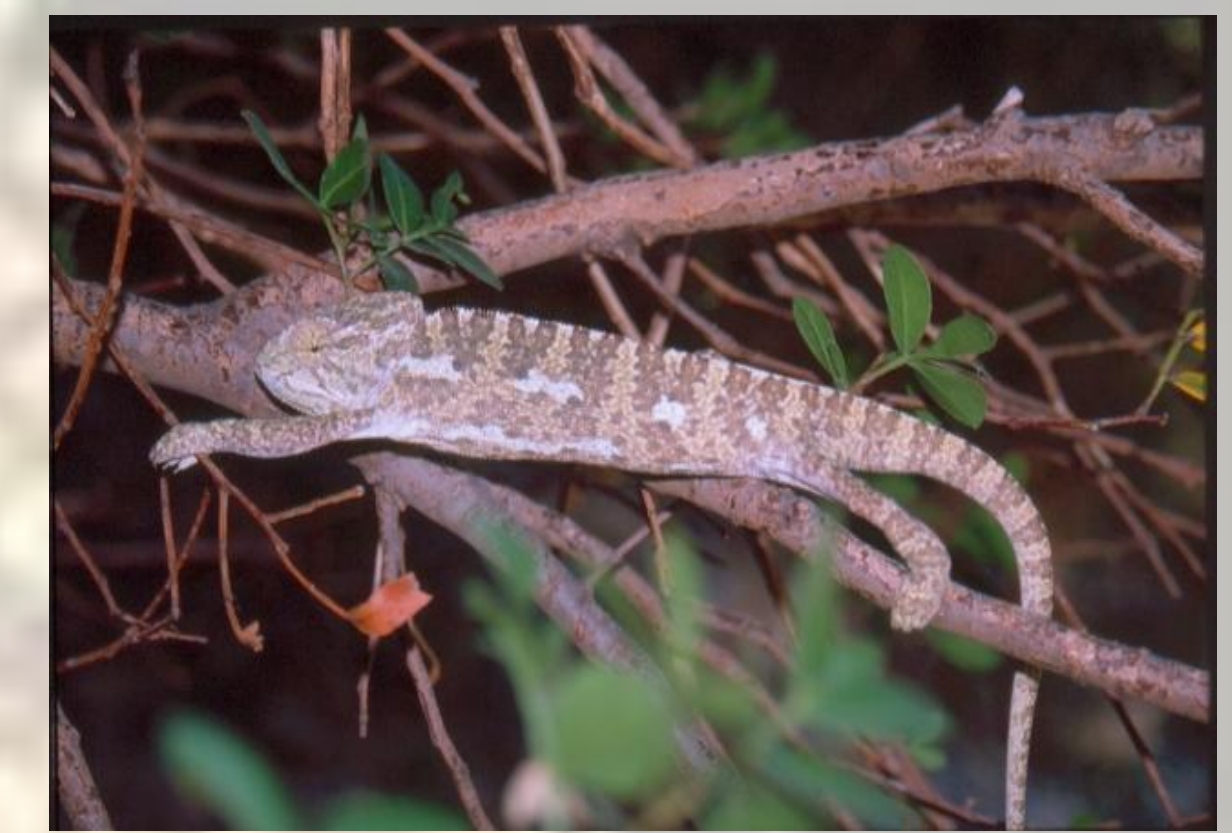
C. chamaeleon from Samos