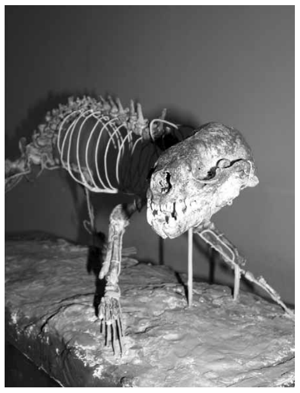
Plate IIIb. Skeleton of the Cretan otter Lutrogale cretensis.