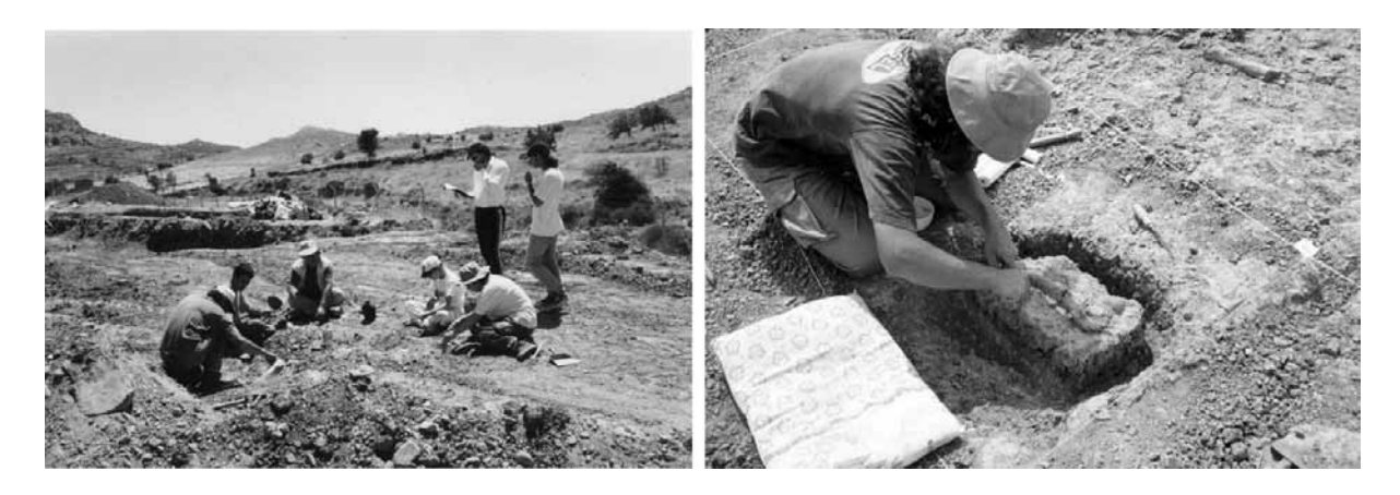
Plate Ia-b. Excavations at Katharo Plain near the village of Kritsa, community of Agios Nikolaos. The locality is especially famous for its large amount of fossils of the dwarf hippo Hippopotamus creutzburgi.