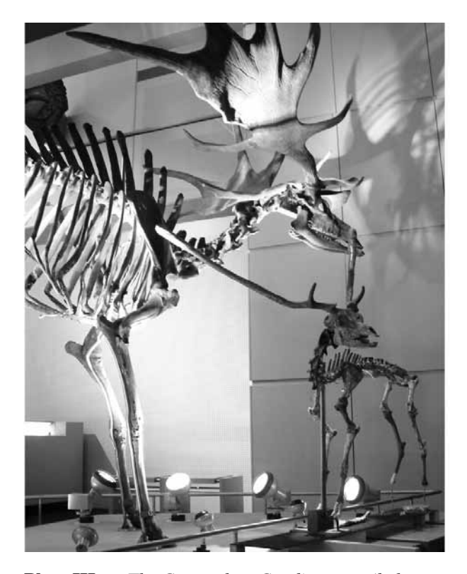
Plate IIIa. The Cretan deer Candiacervus (below, right) differs greatly from mainland deer (left), here represented by one of its suggested relatives, Megaloceros giganteus.

niches ranging from dense forest to prickly rocks.<sup>53</sup> The coexistence of various environments has been confirmed by studies on the rich fossil avifauna.<sup>54</sup> The most typical Cretan deer are the two smallest sizes, which have not only relatively and absolutely short limbs, but also long and simplified antlers; these species occupied a niche close to that of the wild goat of Crete today: barren rocks with thorny bushes (fig. 1), as shown by features of their osteology and goat-like body proportions.<sup>55</sup> It deviated so much from mainland deer that it is impossible to indicate with certainty its ancestor (plate IIIa).<sup>56</sup> The Cretan deer is a typical example of taxonomical problems involving endemic insular mammals, due to the much larger variety than on the mainland, and the strong endemism, wich obscures taxonomy.<sup>57</sup>