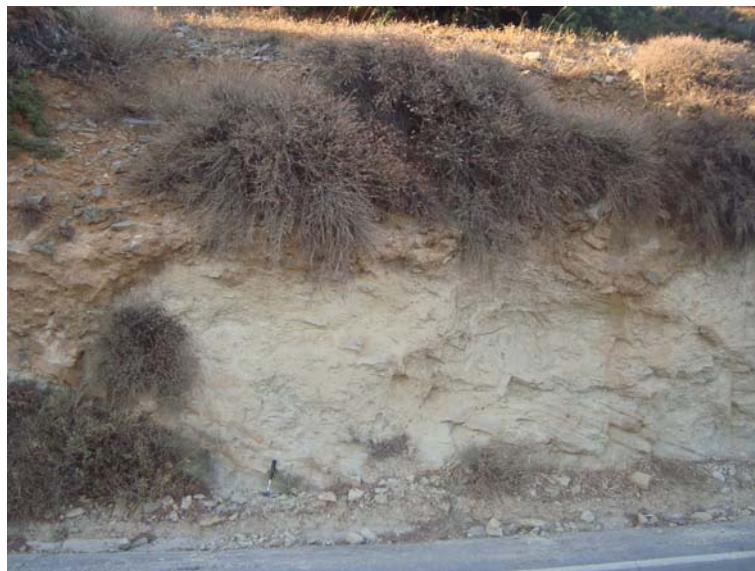
Figure 2 - . General view of the studied section depicting intercalations of carbonate-rich marls with occasionally pure limestone layers

The studied section is exposed in the road section just north of the village of Kalamavka and it comprises bluish, fossiliferous, calcareous mudstones with occasional lenses or layers of fine to very fine grained sandstone. The mudstone is generally massive but in places thin laminations are visible. The sandstone beds are very thin and increase in abundance and thickness in higher stratigraphic levels (Fig. 2). The marls are generally massive due to bioturbation. At non-bioturbated intervals structures produced by traction and suspension fall-out are preserved (Drinia, 1989).