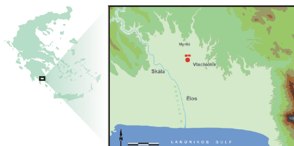
Fig. 1. Geographic location of the new fossil mammal locality Myrtiá (MYP). Graphical scale in km. Contour interval: 100 m.

During a geological survey in Eurotas valley (Laconia, Peloponnesus) in October 2006, a new mammal locality was discovered. The site, dubbed “Myrtiá” (MYP), is located in the area among the small town of Vlachiótiis and the villages of Myrtiá and Peristéri, near the road that leads from Myrtiá to the main road of Skála–Vlachiótiis (Fig. 1). It is a small remnant of an old terrace of the river Eurotas, which outcrops above the present floodplain, forming a low hill (highest altitude: 38 m). It consists of gravels and loose conglomerates deposited in a fluvial environment. Part of the gravels has been quarried several years ago.