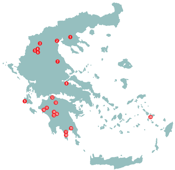
Fig. 3. Distribution of non-endemic Hippopotamus -bearing localities in Greece: 1, Ravin Voulgarákis, 2, Haliákmon Valley (unknown exact location), 3, Perdikkas, 4, Libákos, 5, Kapetánios, 6, Q-Profil, 7, Piniós Valley, 8, Toíchos, 9, Manzavináta, 10, Elis, 11, Ag. Dimitrios, 12, Káto Salmeníko, 13, Limnón Cave, 14, Kyparíssia, 15, Megalópolis, 16, Marathouá, 17, Apídima Caves, 18, Dirós Cave, 19, Myrtiá, 20, Kos. Data according to Desio (1931), Psarianos (1954), Thenius (1955), Milójić et al. (1965), Melentis (1966a, 1966b, 1969), Sickenberg (1976), Stratigopoulos (1986), Symeonidis and Theodorou 1986b) Steensma (1988), Koufos et al. (1989), Tsoukala (1999), Symeonidis and Giannopoulos (2001), Reimann and Strauch (2008) and personal observations.

The Hippopotamus molars have only minimally changed during the genus' evolution and, consequently, their morphology is not taxonomically diagnostic. Nevertheless, the trapezoid outline of M2 in occlusal view has been considered as a specific character of H. antiquus (Thenius, 1955). In a metrical comparison to other dental samples of European Hippopotamus (Fig 4), the molars from Myrtiá plot near the maxima of H. antiquus ranges according to Faure (1985) and appear to be among the largest specimens of the same species according to Mazza (1995). Hippopotamus upper molars from Greece, which can be metricaly compared to the Myrtiá material, are known from the following localities: Manzavináta (Psarianos, 1954), Elis (Thenius, 1955), Haliákmon Valley (Melentis 1966b), Káto Salmeníko (Symeonidis and Theodorou, 1986b), Ravin Voulgarákis (Kostopoulos, 1996) and Dyrós Cave (Giannopoulos, 2000). The molars from Manzavináta and Haliákmon Valley,