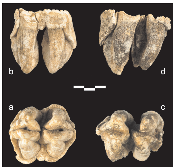
Fig. 2. Hippotamus antiquus from Myrtilá. Left upper second molar (MYP-1): a, occlusal view; b, labial view. Left upper third molar (MYP-2): c, occlusal view; d, labial view. Mesial side is on the left. Graphical scale in cm.

laeontology and Geology of the National and Kapodistrian University of Athens.