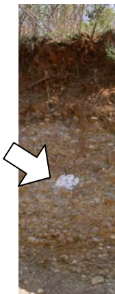
Figure 3. Location of the find (arrow) in the road section. The find is currently stored in the collections of the Ephorate of Palaeoanthropology–Speleology in Athens.

The locality of Tsákoni yielded a single specimen, namely an elephant tusk part (Fig. 2). It is a 102 cm long distal part, with a maximum diameter of 16 cm. The tusk tip was broken before the deposition. The find was directed almost perpendicularly to the road section (Fig. 3), so that it can be assumed that the rest of the tusk has been destroyed during the road construction. The same is possible for any existing parts of the cranial and postcranial skeleton. The specimen is very brittle and badly preserved, as the dentine cones that built the tusk are fragmented into small pieces. Nonetheless, the general morphological characters of the tusk can be well observed: it is moderately bent and it does not show any considerable torsion.