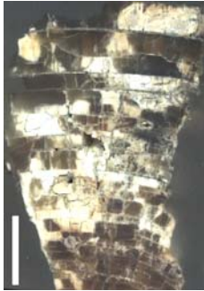
Figure 4. Cross section of the tusk (scale: 10 mm).

Two elephantid genera are known in the Pleistocene of Europe: Mammuthus Brookes, 1828 and Elephas Linnaeus, 1758. The former is represented by three species that form a continuous evolutionary lineage from the Late Pliocene to the Late Pleistocene: M. meridionalis , M. trogontherii and M. primigenius (Maglio 1973, Lister 1996). All three are characterised by tusks that show considerable bend and torsion, which become more expressed towards stratigraphically younger specimens. The latter is represented in the continental faunas by one species, E. antiquus , which is stratigraphically confined to the Middle and Upper Pleistocene. E. antiquus had more or less straight tusks that exhibit weak torsion (Kurtén 1968). It is clear that the morphology of the studied specimen corresponds to that of the genus Elephas and its sole European continental species E. antiquus . However, it is preferably referred to as cf. E. antiquus , as the bad preservation and its small dimensions allow for a degree of uncertainty in morphological observations.