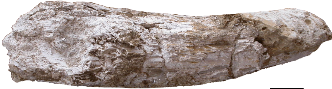
Figure 2. Lateral view of the tusk specimen (scale: 10 cm).

The valley of Haliákmon, as well as the wider area of the Grevená–Kastoriá basin, have already yielded several fossil proboscidean remains, which are reported or studied by Brunn (1956), Psarianos (1958), Melentis (1966), Paraskevaidis (1977), Steensma (1988), Tsoukala & Lister (1998) and Tsoukala (2000). This study describes a new locality with an elephant fossil. It is located on the right bank of the river Haliákmon, north of the village Tsákoni (Prefecture of Kastoriá, Municipality of Hag. Triáda — Fig. 1) and it was spotted by a villager in a country road section. Geologically, the area is an old terrace of the river, which consists of a fairly hard fluvial conglomerate. The site was excavated in August 2003, by the Ephorate of Palaeoanthropology–Speleology with the technical help of the Municipality of Hag. Triáda.